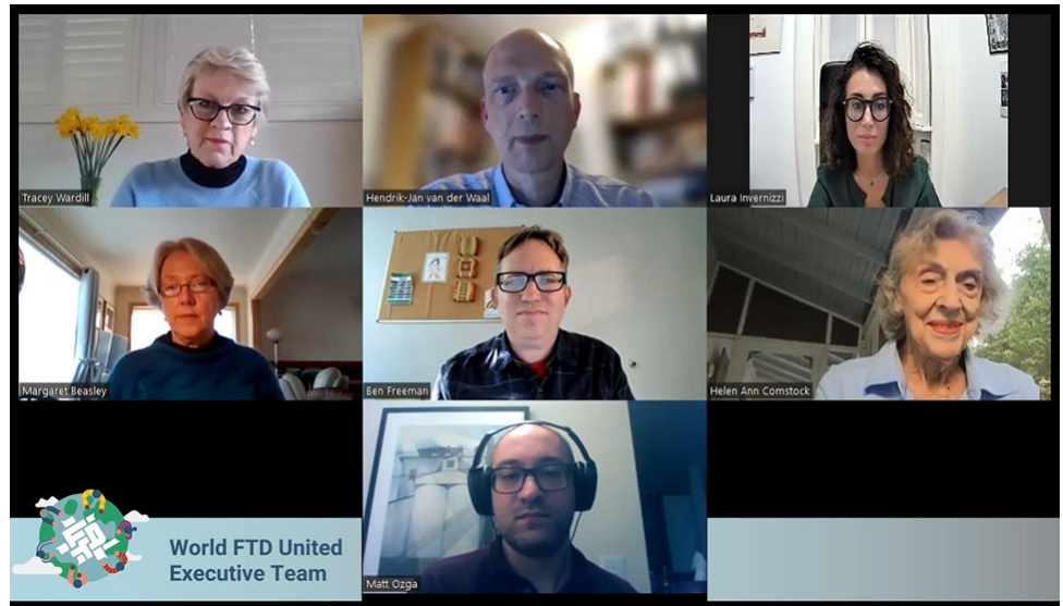
Members of World FTD United’s Executive Committee shared a message for World FTD Awareness Week 2022.

This year’s World FTD Awareness Week featured numerous events tailored around AFTD’s new awareness campaign, Ask About FTD. Members of AFTD’s community took to social media to share the stories of their own journey with FTD, encouraging others to #AskAboutFTD to raise FTD awareness. Community members were encouraged to reach out to healthcare professionals to help them learn about FTD and write letters of support for families with a recent diagnosis.