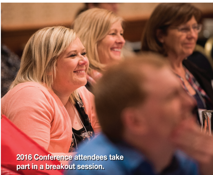
2016 Conference attendees take part in a breakout session.